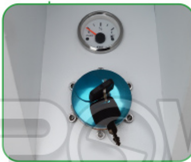
External Fuel Filler