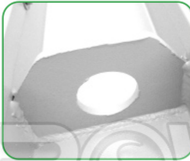
Single Lifting Point