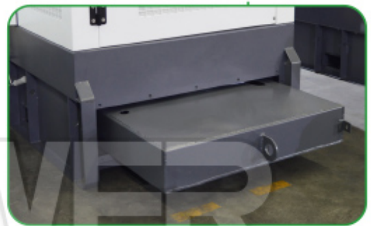
Draggable Fuel Tank for Easy Cleaning